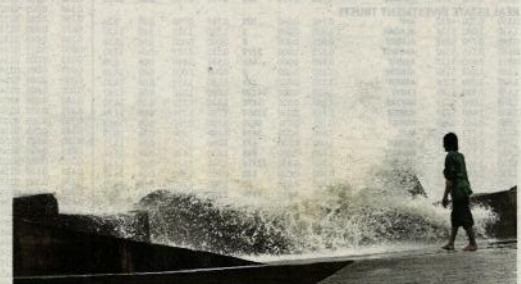
Strong waves triggered by tropical storm 'Pabuk' crashing into the Chendering fishing jetty in Kuala Terengganu yesterday.

ment issued warnings of strong northeasterly winds of 50 to 60kph, with waves up to 4.5m on the waters off Sarawak, Kelantan, Terengganu and Pahang until Saturday.