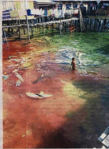
Under threat: Foreign tourists have taken pictures of sharks being hunted and slaughtered in Sabah, which have gone viral.

It was also reported that in 2017, 697 tonnes of shark (0.43%) and 1,507 tonnes of stingray (0.93%) catches were recorded by the department.