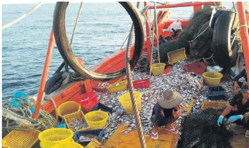
Bot nelayan laut dalam yang berjaya ditahan oleh Cawangan Taman Laut dan Perlindungan Sumber di perairan dekat Pulau Perhentian.