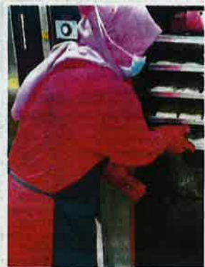
MURTABAK dimasukkan ke dalam mesin untuk dimasak.