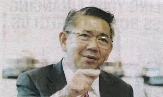
Salahuddin says the consolidated policy will enable the national paddy yield to increase

ment tenure to be between five and 10 years. Each plot could be expanded between 10ha and 50ha for small-sized farmers while private companies could manage land plots between 100ha and 1,000ha.