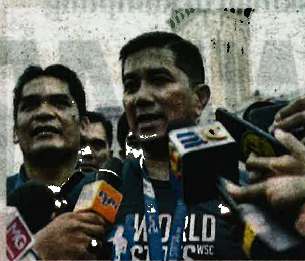
Mohamed Azmin ketika ditemui pemberita di Dataran Merdeka, Kuala Lumpur semalam.

Beliau berkata, pelaksanaan pertanian pintar berpotensi besar dalam membantu mengembangkan sektor pertanian khusus untuk tujuan eksport.