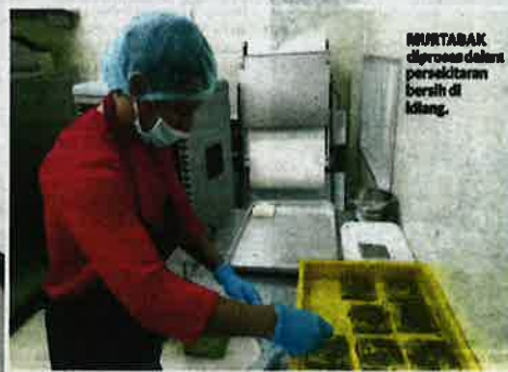
MURTABAK diproses dalam persekitaran bersih di kilang.