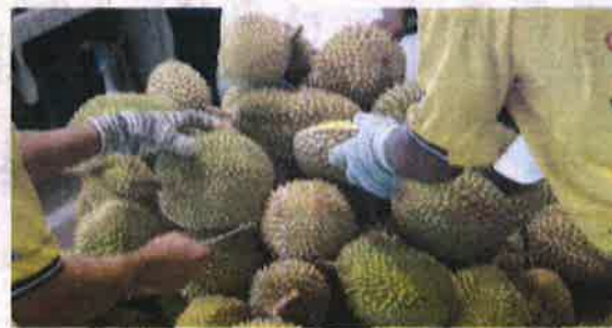
The high-value agro-food items such as durian are booming and our country should take advantage of this