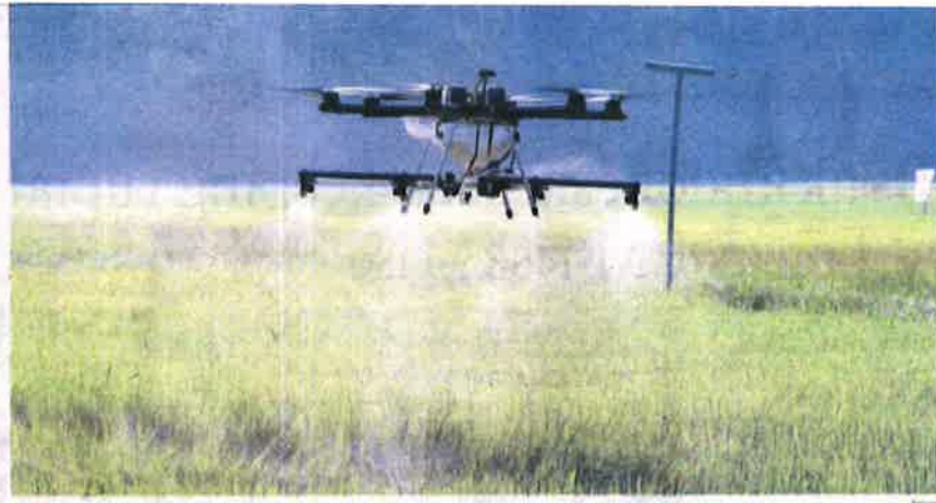
Drona Padi/Pada by Unsworth/Pada Malaysia. The drone technology is able to capture images of 140ha-950ha of the paddy field in an hour.

According to the midterm review that we have done, the current agro-food policy is set