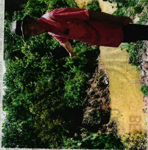
Wakil pesawah menunjukkan kawasan pemetung yang runtuh hampir enam tahun lalu.