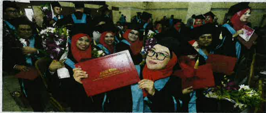
SEBAHAGIAN peserta yang menerima sijil pada majlis penyampaian sijil Agrobank - UPM di Fakulti Pertanian, UPM, Serdang, baru-baru ini.

"Program ini merupakan usaha untuk memantapkan pengetahuan dan kemahiran teknikal serta kesiapsiagaan pegawai bank khususnya di peringkat pengurusan supaya