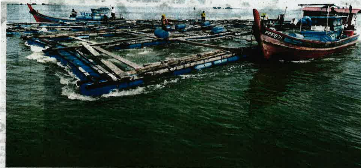
KEADAAN ternakan ikan dalam sangkar yang rosak teruk akibat ribut dibawa ke jeti untuk dibaloi di jeti Pendaratan Ikan Sg Udang, Nibong Tebal, Pulau Pinang.