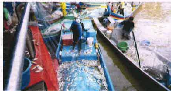
Through FAMA's 'My Best Buy', the fisherman could negotiate their catches directly and get better prices as the MoA eliminates the chains of middlemen

to achieve its target despite the shortfalls in agro-related industries.