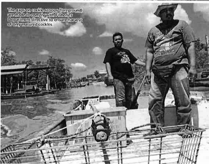
The gaps on cockle scoops (foreground) are made to comply with Fisheries Department directive to ensure harvest of only matured cockles.