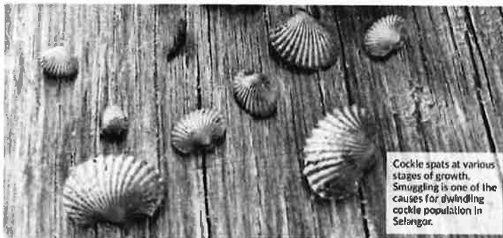
Cockle spats at various stages of growth. Smuggling is one of the causes for dwindling cockle population in Selangor.

Those that were buried too deep within the seabed were either shifted or had excess mud removed