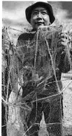
Volunteer divers showing the old fishing nets found near artificial reefs at Bagan Nakhoda Omar.