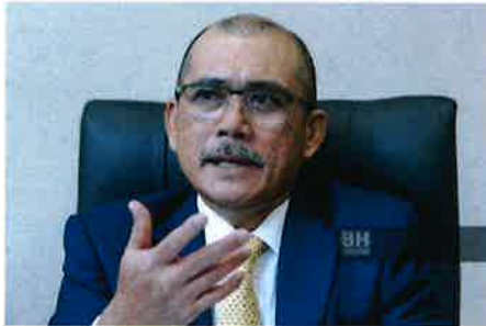
Kementerian Kesihatan Malaysia.

KUALA LUMPUR: Kerajaan tidak bercadang menyekat sebarang aktiviti membabitkan rantaian bekalan dan pemasaran makanan sepanjang tempoh Perintah Kawalan Pergerakan (PKP) ini berlangsung bagi memastikan bekalan mencukupi untuk semua rakyat negara ini.