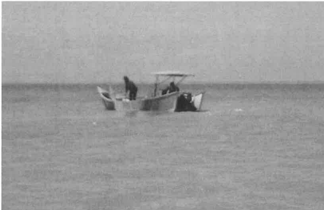
Fishermen fishing at Batu Satu Lutong seafront.