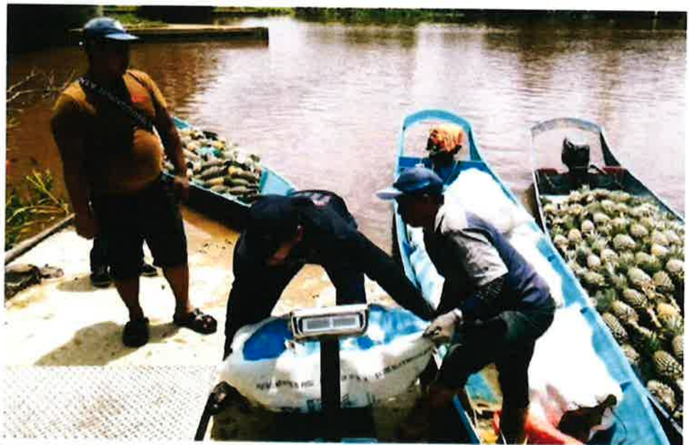
Farmers bring their pineapples and citrus fruits for sale to Fama representatives at Sungai Ijas, Meradong in Sarikel.

He then called upon the farmers to approach their nearest Agriculture Department