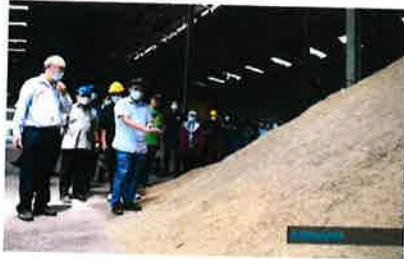
produce due to the MCO.

KUALA SELANGOR, April 18 -- A total of 140 Federal Agricultural Marketing Authority (FAMA) outlets nationwide have recorded RM80 million in sales since the beginning of the Movement Control Order (MCO) on March 18.