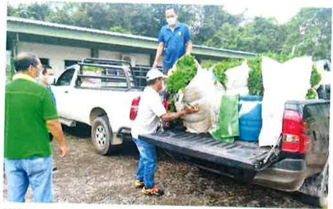
PERTUBUHAN Peladang Julau membeli sayur cangkuk manis seberat 168kg daripada petani sayur di Julau.

teri Pemodenan Pertanian, Tanah Asli dan Pembangunan Wilayah menambah untuk nelayan, kerajaan telah memperuntukkan sejumlah RM600,000 kepada Lembaga Kemajuan Ikan Malaysia untuk membeli hasil tangkapan mereka.