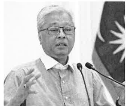
ISMAIL Sabri ketika sidang media harian Perintah Kawalan Pergerakan (PKP) di Bangunan Perdana Putra semalam.

Terdapat dakwaan bahawa rata-rata penduduk berada dalam keadaan stres dan bimbang kerana bekalan barangan harian terutama makanan semakin berkurangan. - Bernama