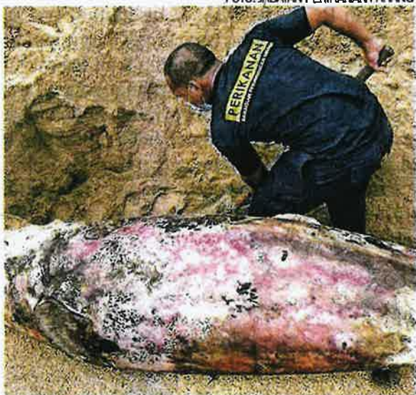
Kakitangan Jabatan Perikanan menanam bangkai ikan lumba-lumba berhampiran Pantai Serandu kelmarin.

PEKAN - Seekor ikan lumba-lumba ditemui mati terdampar di Pantai Serandu di sini petang kelmarin.