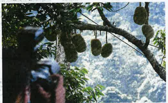
WAKIL media merakam gambar raja buah iaitu buah durian semasa melawat dusun durian, Karuna Hill, Sungai Pinang, semalam. Datuk Bandar Majlis Bandaraya Pulau Pinang (MBPP), Datuk Yew Tung Seang yang membuat lawatan ke dusun berkenaan meminta pekebun durian menjalankan perniagaan durian secara terus dengan menghantar bekalan kepada pemborong atau peruncit di gerai pasar dan pasar raya. Pekebun durian juga digalakkan menjalankan perniagaan dalam talian. Katanya lagi, pekebun durian perlu memohon kad pergerakan bagi penghantaran durian kepada pelanggan melalui pautan Facebook MBPP dan laman web MBPP. Menurut Yew, penjualan durian di tepi jalan dan kedai makan adalah tidak dibenarkan.