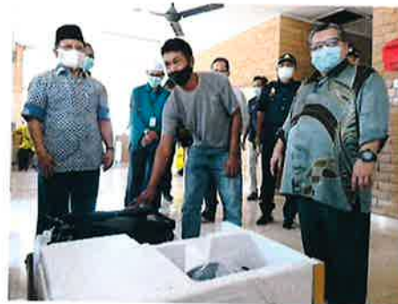
Ahmad (kiri) menyerahkan enjin bot kepada penerima OKU pada majlis penyempulan bayaran sagu hati nelayan kelmarin.

Timbalan Menteri Pertanian dan Industri Makanan, Datuk Seri Ahmad Hamzah berkata, projek Penghantaran Bekalan Elektrik ke Pulau Besar dari Pantai Siring pada tahun 2013 itu mengakibatkan nelayan terjejas punca pendapatan kerana tidak dapat turun ke laut untuk menangkap hasil laut.