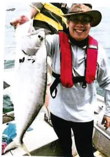
Tang said it was best to avoid going out fishing now.

"All our members have been informed and they, too, are