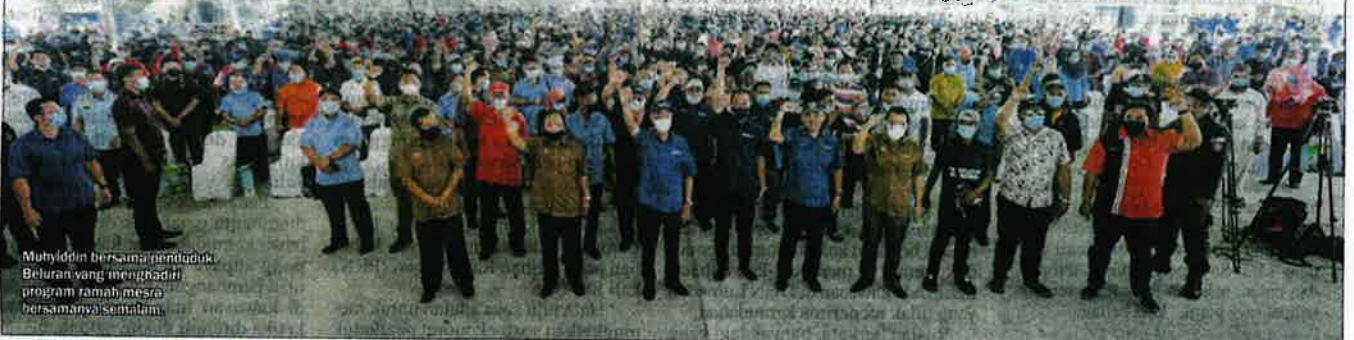
Muhyiddin bersama penduduk Beluran yang menghadiri program ramah mesra bersamanya semalam.

"Kita berharap bantuan menerusi peruntukan ini dapat merencanakan semula aktiviti pengeluaran makanan dan memulihkan kembali pendapatan peladang, penternak dan nelayan yang terjejas akibat Covid-19. Kerajaan yang berfungsi inilah perlu kita tegakkan," katanya.