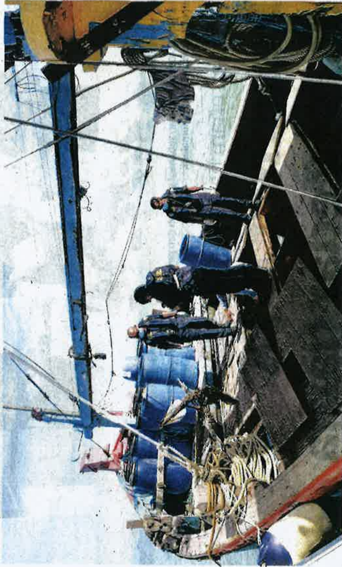
ANGGOTA APMM memeriksa kapal yang digunakannya untuk menangkap ikan di Pulau Sembilan dekat Bagan Datuk kelmarin.

Ujar Shahrizan, pihaknya sentiasa berusaha untuk mengesan kemasukan PATI melalui laut Perak.