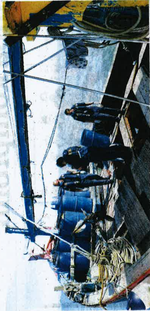
ANGGOTA Maritim Malaysia membuat pemeriksaan ke atas sebuah kapal nelayan dalam operasi khas di perairan selatan Perak dan Pulau Pangkor dekat Lumut, Perak semalam.

"Seorang daripada mereka iaitu warga Indonesia yang bekerja di sangkar ikan dida-