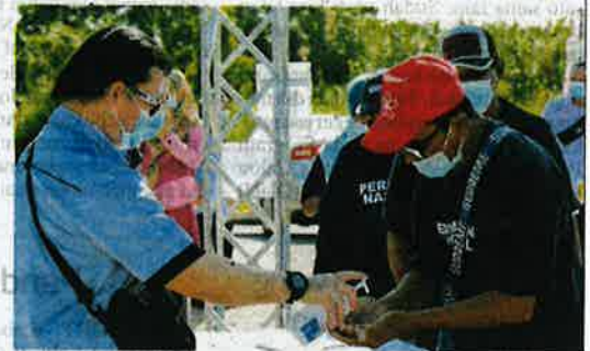
Orang ramai yang hadir diminta mematuhi SOP Covid-19 termasuk memakai pelitup muka dan menggunakan cecair pembasmi kuman.