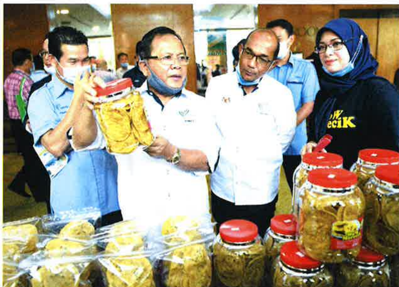
Ahmad (second left) visits the exhibition booths.

SEREMBAN: The average value of Malaysia's tropical fruit exports increased by 12.29 per cent per annum from 2015 to 2018, said Deputy Minister of Agriculture and Food Industry I Datuk Seri Ahmad Hamzah. He said exports grew from RM821.5 million in 2015 to RM1.124 billion in 2018, while the value of imports of tropical fruits also increased by 9.95 per cent per annum, from about RM1.2 million in 2015 to RM1.5 million in 2018.