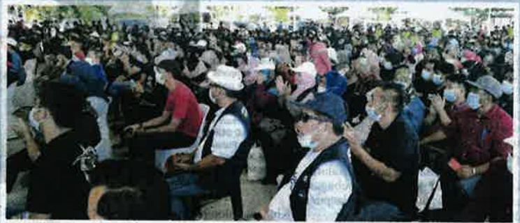
Antara penduduk Beluran yang menghadiri Program Ramah Mesra YAB Perdana Menteri semalam.

Muhyiddin mahu petani, penternak dan nelayan pelopori sektor pertanian moden