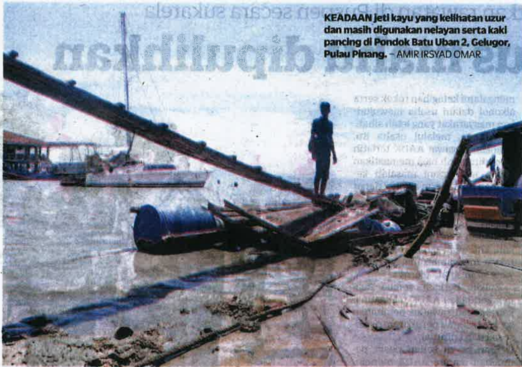
KEADAAN Jeti kayu yang kelihatan uzur dan masih digunakan nelayan serta kaki pancing di Pondok Batu Uban 2, Gelugor, Pulau Pinang.