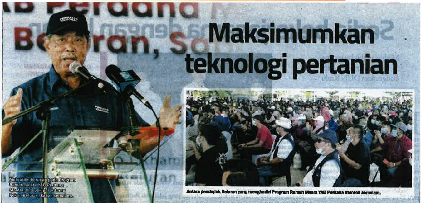
Muhyiddin berucap pada Program Ramah Mesra YAB Perdana Menteri di tapak pasar tamu Pekan Beluran, Sabah semalam.