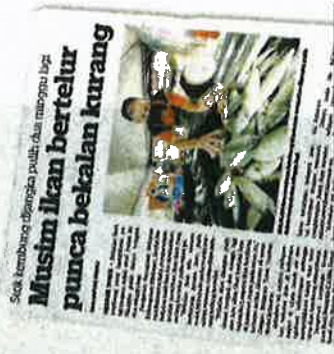
Seke kembang ditinggi pulih, dan mabang by

Musim ikan bertelur punca bekalan kurang