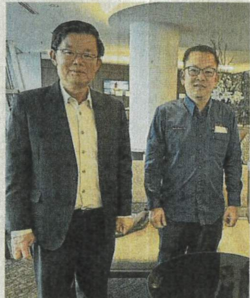
■陈泓縑（右）与曹观友（左）在机场碰面时，就猪瘟扩散问题交换意见，赞同以生物安全（biosecurity）为本的管控措施应对国内猪瘟扩散问题。

另一方面，陈泓縑说，他的同僚甲洞国会议员林立迎日前陪同雪隆屠业行，提到雪隆一带的猪肉供应或面临断市的问题，他和部门官员会与养猪业者保持密切沟通，以尽早解决猪瘟肆虐问题，确保猪肉供应和生物安全管控之间能取得平衡。（TSI）