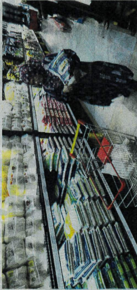
PENGINJUNG memilih beras yang dijual di sebuah pasar raya ketika tinjauan di Wangsa Maju, Kuala Lumpur.

"Sudah lama kami tidak dapat bekalan beras SST. Pembekal beritahu SST hanya dijual kepada pasar raya besar saja. Walaupun permintaan SST tinggi, kami tidak boleh buat apa-apa kini jual beras putih import dan import saja kerana hanya itu