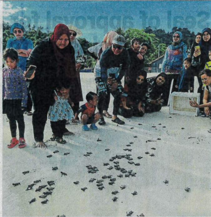
The release of sea turtle hatchlings is a major tourist draw at the Mersing Islands.