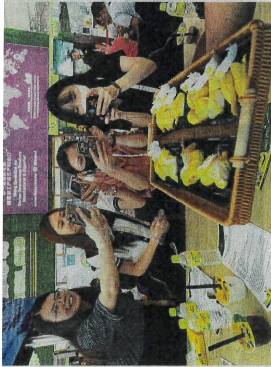
Die-hard fans of the king of fruits at the launch at D'king SS2, Wonderland in Petaling Jaya.