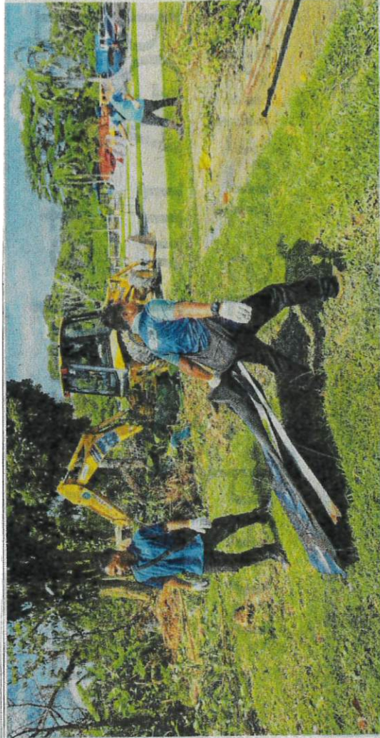
Kakitangan MBSJ merobohkan struktur binaan dan kebun haram di sekitar Pangsapuri Enggang, semalam.