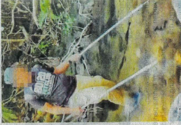
Video tular memaparkan bekas ADUN berkenaan menangkap ikan menggunakan peralatan telarang.

Terdahulu tular video berdurasi 24 saat di media sosial memaparkan bekas ADUN berkenaan menangkap ikan menggunakan renjatan elektrik.