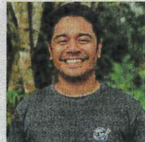
Peris says coral bleaching will affect not only marine life but also the livelihoods of local communities and tourism players.