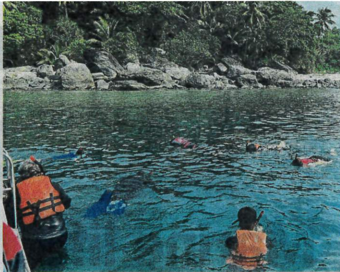
Coral reefs serve as habitats for small crustaceans, breeding grounds for fishes and are the main attraction at the Mersing islands.