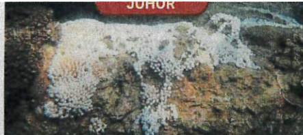
Coral bleaching is caused by the rising ocean temperatures.