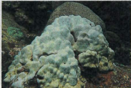
A dead boulder coral in Mersing.